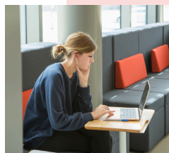
Create a Study Schedule That Works