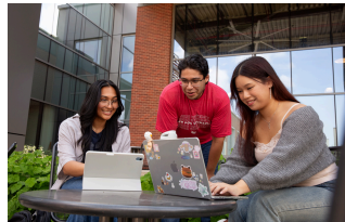
Smart AI Strategies for Student Success

Academic Calendar Student Events Calendar Athletics Calendar Student Success Workshops