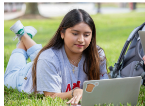
The 8-8-8 Formula

Don't forget - progress over perfection.